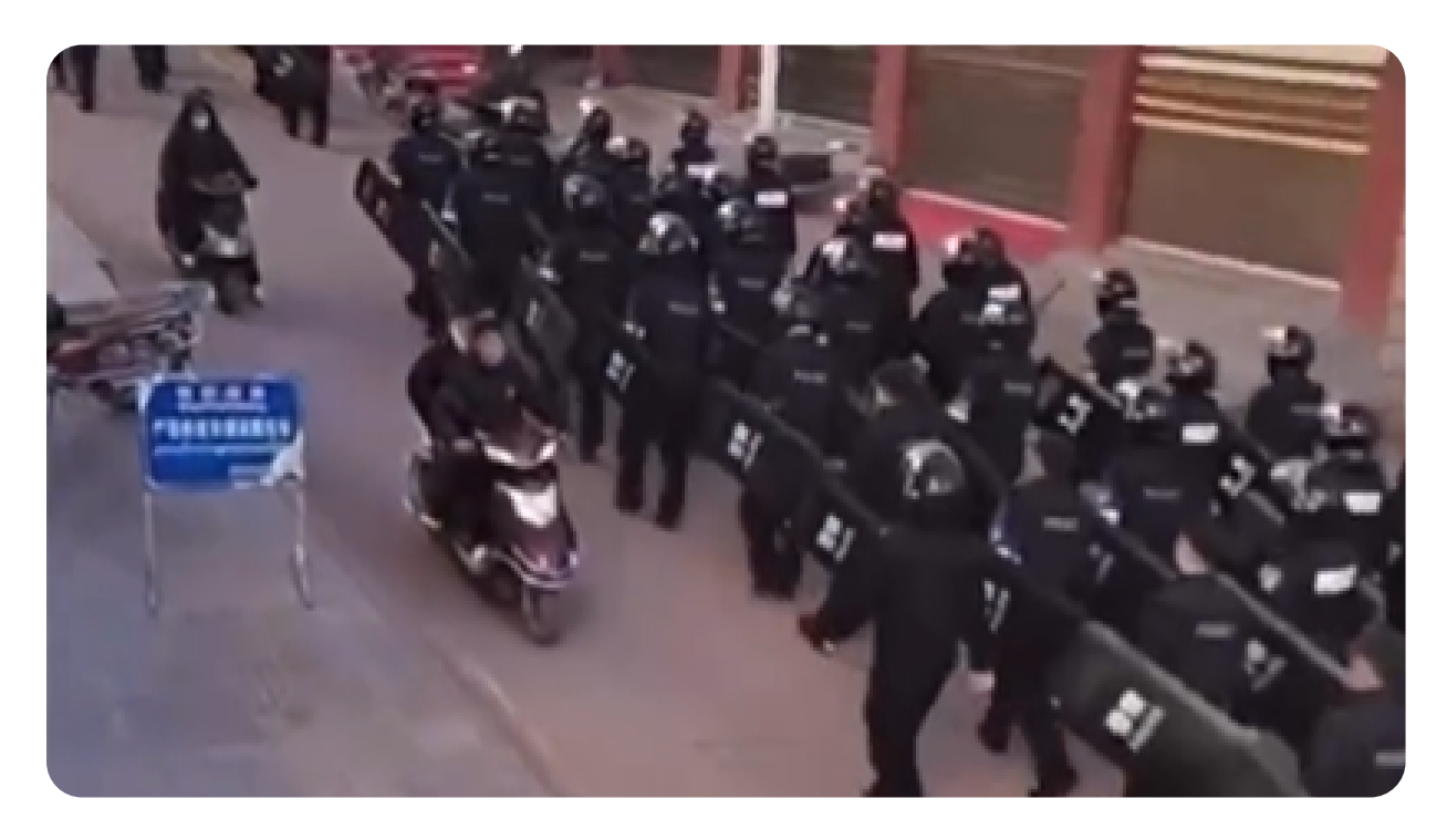
Figure 5: Screenshot of a group of policemen encircle monks in Wonpotoe Township.

In a third video, also recorded at night, a monk from Yena Monastery is surrounded by a group of monks and laypeople, saying: "We didn't do anything against the Chinese! We didn't break the law, we followed their rules! Why do we have to leave our homes? The monastery was our home for generations. It is our home today [unclear words]. Why are you bringing trouble to these peaceful people? Why are you guys doing this? What is the reason you people are beating us? Why?"37