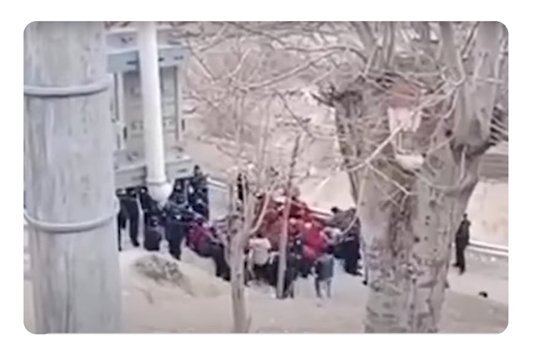
Figure 6: Screenshot image of People's Armed Police arriving in Wonpotoe Township to impose military lockdown. Posted on 28 February 2024 on Tibet Times Youtube channel.

On 28 February, People's Armed Police marched through a street in Wonpotoe Township, of which the video was widely shared among exile Tibetans. Nearly 200 police in riot gear can be seen in the video.39