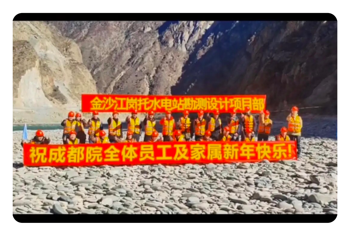
Figure 4: Screenshot image of a group of workers holding a red banner with yellow font text that reads, "Drichu Kamtok hydropower station survey and design project department. Happy New Year to all staff and families of Chengdu Institute". Posted on Douyin on 23 December, 2023.

Some areas of Shiba, as well as Yachi village - located on the east riverbank 20 kilometres north from the dam site - have both been marked as at potential risk of landslides because of the dam construction. The findings were reported33 after delegation made a visit to Chakra Township,<sup>34</sup> a valley adjacent to the sacred mountain, where the planning and design of the dam construction is taking place. The Dege County Water Conservancy Bureau, the Preparatory Office of Gangtuo Hydropower Station Construction Company, Chengdu Survey and Design Institute Co. Ltd., and other departments made the visit on 25 April 2022 on "preliminary exploration and hydropower resettlement of Gangtuo Hydropower Station".