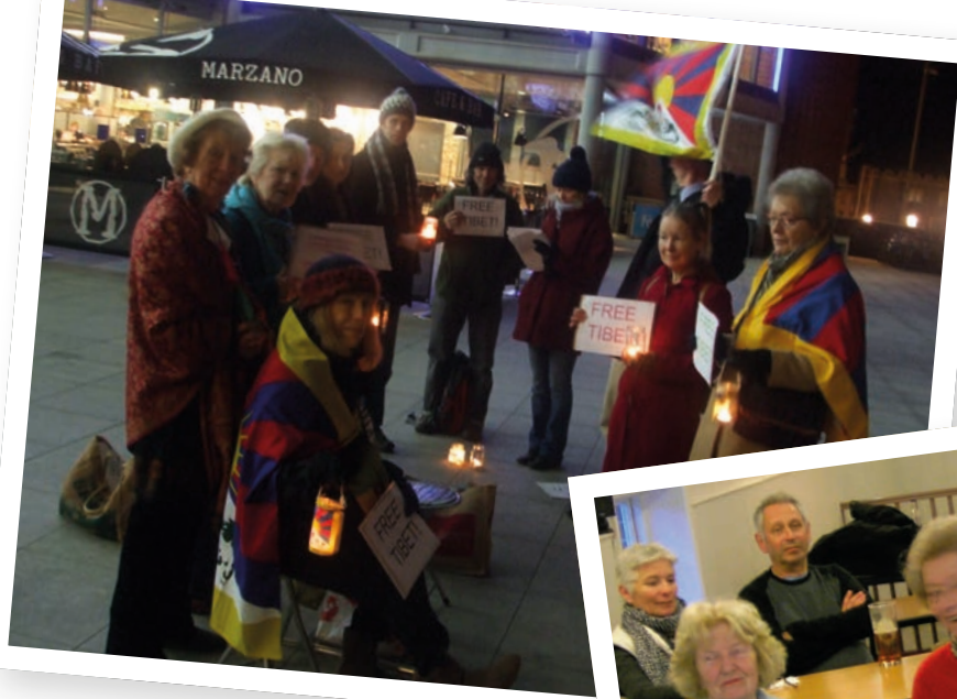
Norwich Tibet Group's vigil (above) and talk (right).