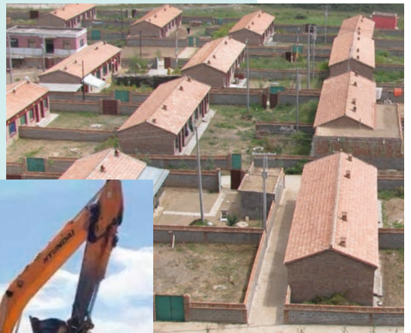
Left: Rinchen protest; Above: Nomad resettlement in Rebkong.