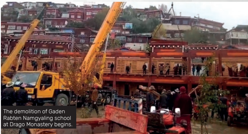
The demolition of Gaden Rabten Namgyaling school at Drago Monastery begins.

From the wholesale destruction of the Cultural Revolution under Mao in the late 1960s and 1970s, to the kidnapping of the six-year-old Panchen Lama in 1995 and the crackdown on monks and nuns after the 2008 uprising, the CCP has never ceased to treat Tibetan Buddhism as an obstacle and a threat. By expressing their culture, living their distinct way of life and practising their religion, Tibetans have defied the CCP and challenged its overarching aim of colonising Tibet.