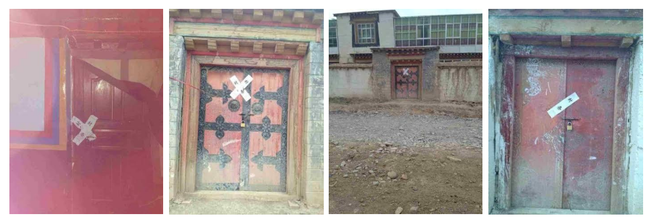
9 - Images from Drongna monastery following the raid, showing rooms and halls taped off

Also in November Tibet Watch received reports that the authorities had shut down Drongna monastery, one of the largest in the county, and arrested a number of monks as well as a language teacher named Kelsang Dhondup.<sup>14</sup> There have been restrictions on Drongna monastery for some time already and, consequently, locals were unsure how many monks were living in the monastery at the time or how many were arrested.