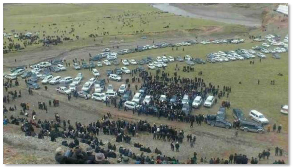
2 - Protestors gathering near Naglha Dzamba mountain

In addition to protesting, local people filed petitions with various Chinese government offices asking them to stop the mining. Eventually, the authorities agreed to halt the work. Furthermore, they declared that Naglha Dzamba mountain had been recognized as part of a cultural and environmental preservation area.