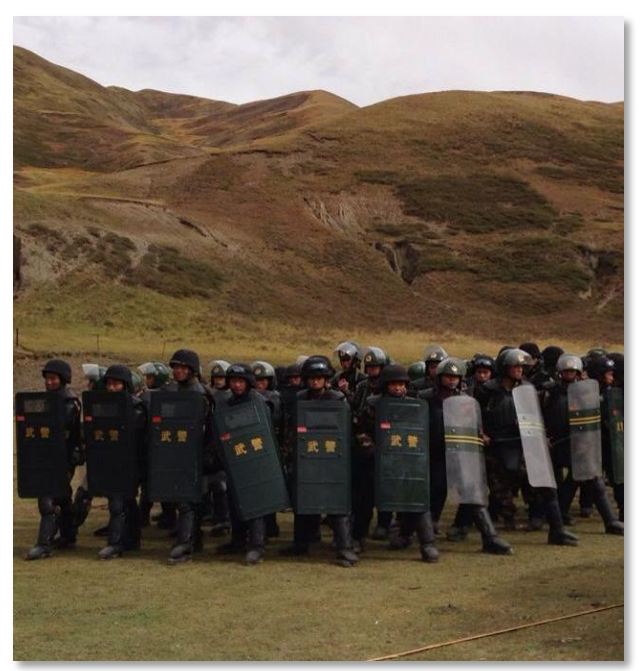
4 - Security forces preparing for deployment in Driru

On 28 September, villagers from Mowa and Monchen villages in Driru township decided that they had had enough. They gathered up the flags and threw them into a nearby river. The Chinese authorities responded by sending in armed forces and police. The ensuing clash lasted around three hours and involved the use of gunfire by Chinese forces. However, Tibet Watch was unable to verify whether the troops were deliberately firing at unarmed Tibetans or whether they were firing into the air in an attempt to control the crowd.