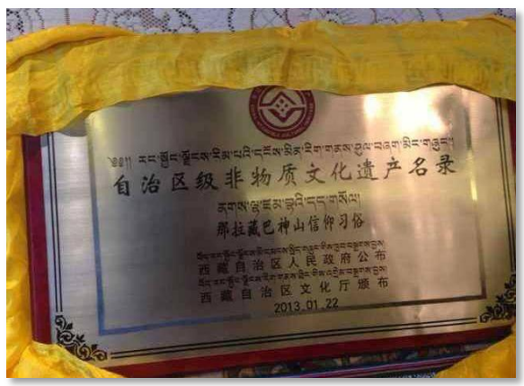
3 - ICH Certificate for Naglha Dzamba

In addition to protesting, local people filed petitions with various Chinese government offices asking them to stop the mining. Eventually, the authorities agreed to halt the work. Furthermore, they declared that Naglha Dzamba mountain had been recognized as part of a cultural and environmental preservation area.