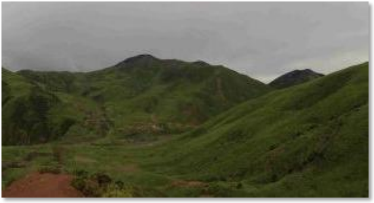
1 - Naglha Dzamba mountain in Driru

Acts of protest and repression in Driru both peaked in October/November 2013 but the current situation is closely linked to events which took place in May 2013. A Chinese government-affiliated company arrived in the county and started work on Naglha Dzamba mountain. They claimed they were working on a road and hydroelectric power construction project. For the locals, it was reminiscent of what happened in 2010.